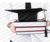
◀ IELTS Certificate (Guarantee Course)