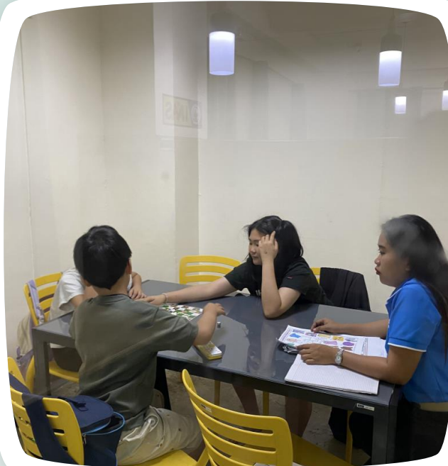
Encouraging English Interest through Group Plating