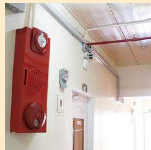
Fire alarms, sprinklers