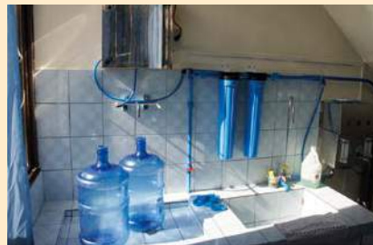
Safe drinking water