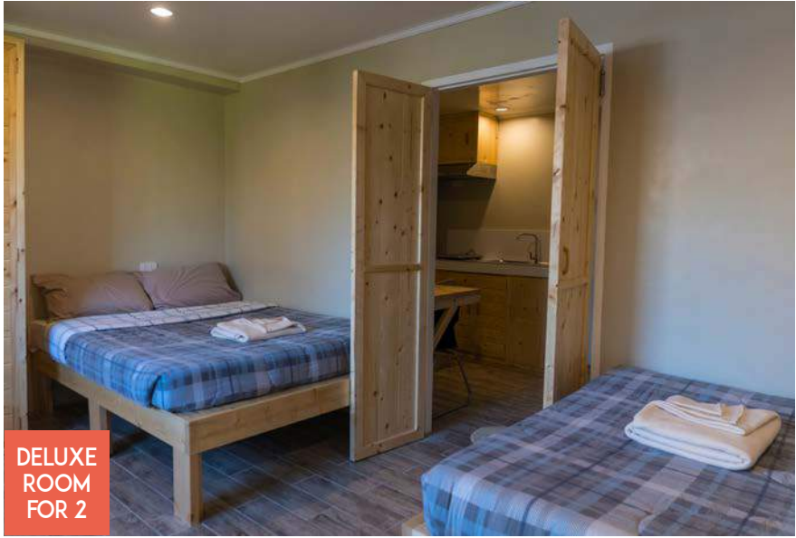
DELUXE ROOM FOR 2

To support a well-balanced school life, Monol ensures that the essential and basic services in the academy are sustained and further improved. By providing these with the best quality, students are assured of a convenient and comfortable stay during their study program and focus solely on their academics.