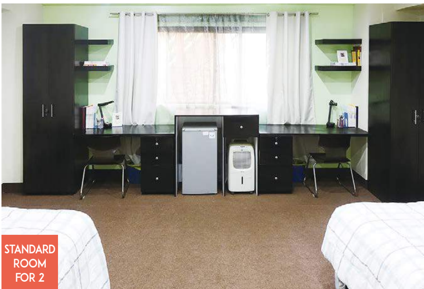
STANDARD ROOM FOR 2