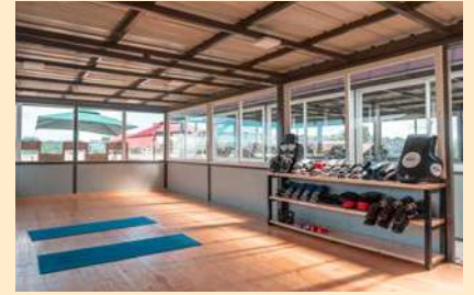
Yoga and Pilates room