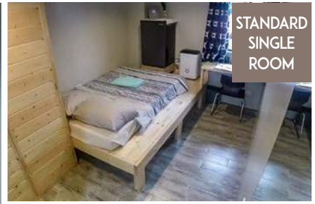
STANDARD SINGLE ROOM