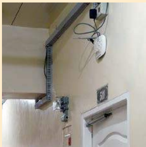
Wi-Fi access points