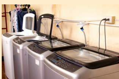
DIY Laundry Station