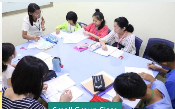
Small Group Class