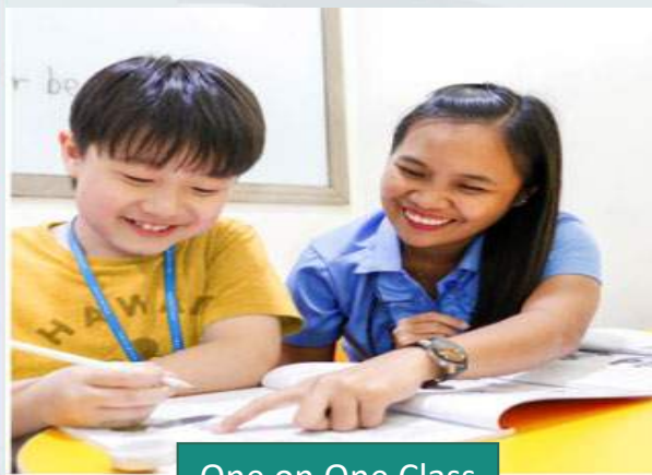
One on One Class