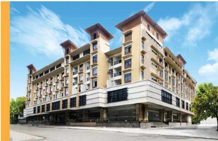
SMEAG Global Education - Capital Campus