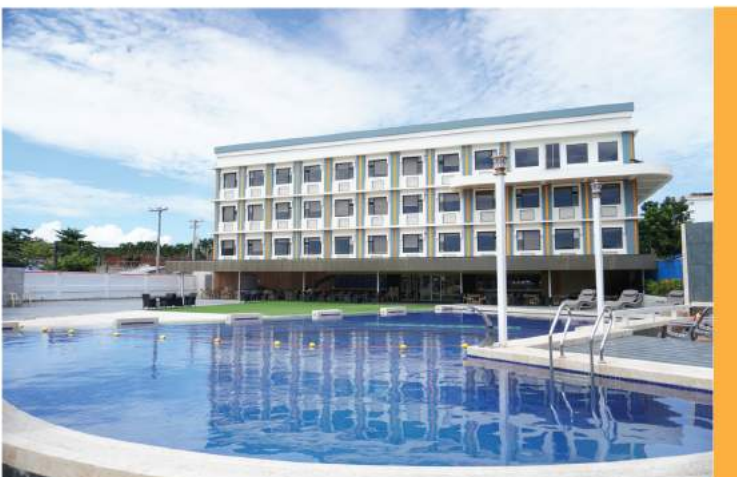
SMEAG Global Education - Encanto Campus

Hello, everyone! SMEAG is here to share about the interesting events and fun activities that took place in the past week. Let's find out together! ~