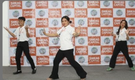
Energy in motion: Students take the stage to perform an upbeat dance routine, reflecting the high spirits, confidence, and vibrant energy of the SMEAG community during the event.