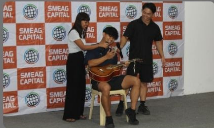
A heartfelt musical moment: Students share the spotlight, performing a song together and showcasing their musical talents, bringing the audience closer through the universal language of music.

The stage came alive as students stepped out of their comfort zones to showcase their hidden talents. From soulful musical performances to high-energy dance routines, these moments highlighted the vibrant personalities and creativity that make our community so unique. It was a beautiful display of confidence, proving that learning at SMEAG goes far beyond textbooks.