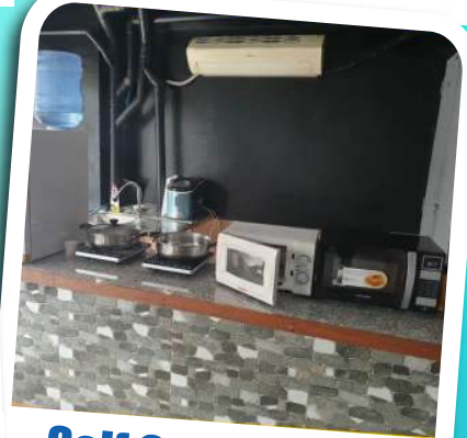
Self Cooking Area