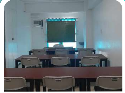
Self Study Room