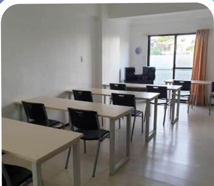
IELTS Mock Test Room