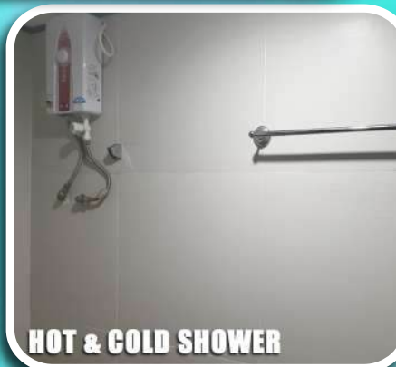
HOT & COLD SHOWER