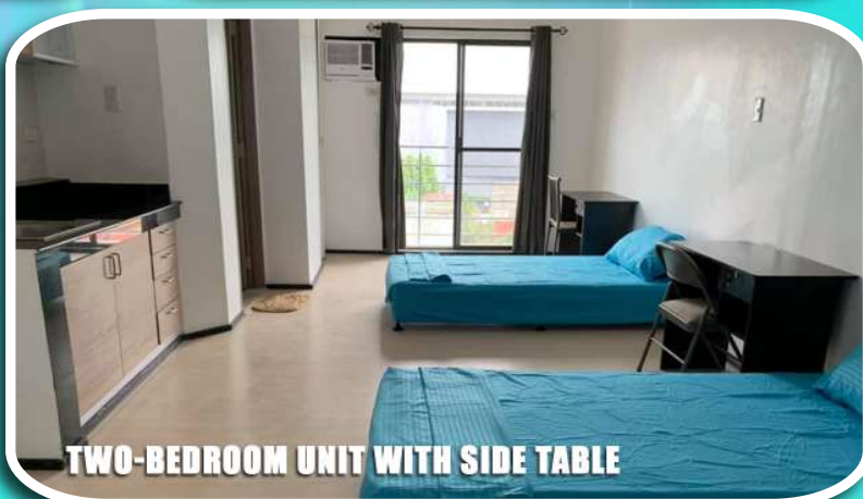
TWO-BEDROOM UNIT WITH SIDE TABLE