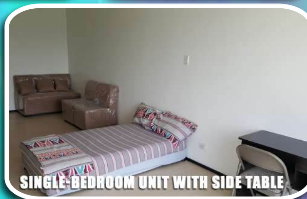
SINGLE-BEDROOM UNIT WITH SIDE TABLE