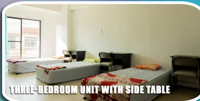
THREE-BEDROOM UNIT WITH SIDE TABLE