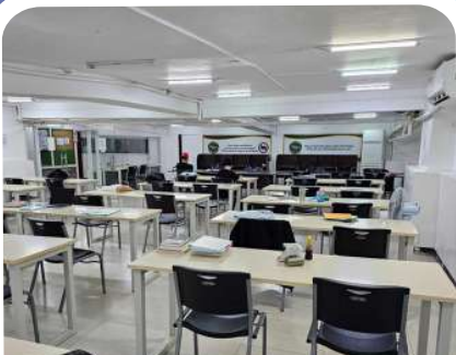
Self Study Room