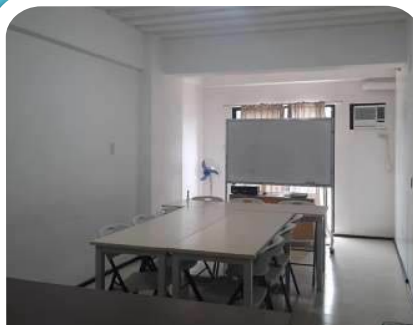
Self Study Room