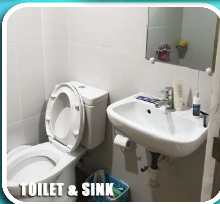
TOILET & SINK